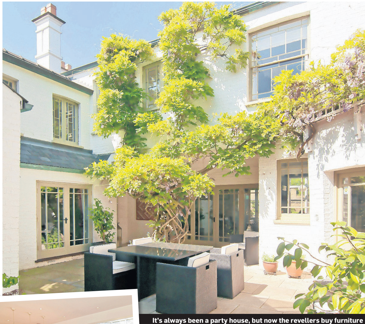
It's always been a party house, but now the revellers buy furniture

Glimpsed from behind the high walls that gird its corner plot, the Old Mill House, in its carefully landscaped half-acre of garden, certainly invites speculation. When Deborah was growing up in Cambridge, she used to pass the house every day on her way to school, intrigued by the tantalising whiff of scandal it gave off. Back then, it was the home of Louis Stanley, who his stepdaughter later claimed was the illegitimate son of the Liberal prime minister Herbert Asquith and his lover Venetia Stanley.